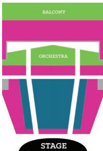
Patricia Reser Center for the Arts